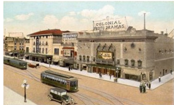
Figure 1. Richmond's streetcars helped bring Brookland Park Boulevard to prominence 1 .

Since then, the community has done anything but sit idly. Over the last two decades organizations such as the Richmond Neighborhood Housing Services (NHS) and the Highland Park Community Development Corporation have worked to restore the area's beautiful homes. Neighborhood civic associations such as the Northside Community Civic Association and the Battery Park Civic Association, have worked hard to improve the quality of life in the neighborhood. Over the years, merchants and property owners have organized efforts to improve the commercial district as well. In 1996, the City designated Brookland Park Boulevard a RRHA Conservation and Redevelopment area, and the City's CARE program has provided rehabilitation financing and assistance to business owners. These efforts have helped to reverse the decline of the corridor. In the meantime, the pace of neighborhood revitalization has picked up, thanks to the City's Neighborhoods in Bloom program.