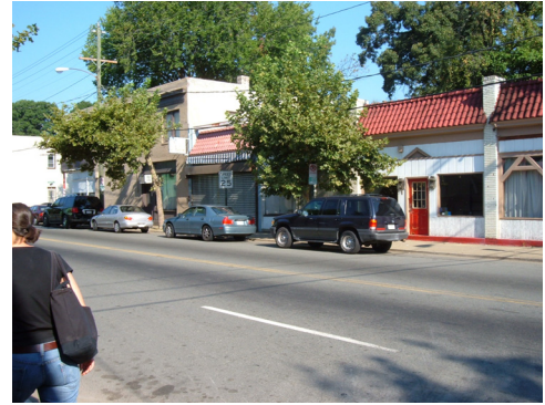
Figure 2. The Boulevard’s scale and historic buildings are a solid foundation for redevelopment.

Incomes in the surrounding neighborhoods are also rising, and many seniors in the area seem to have substantial and growing equity in their homes. These seniors and other residents are very active in neighborhood civic associations, working to make their neighborhoods safer, cleaner and stronger. Brookland Park Boulevard also has a relatively strong base upon which to build a thriving commercial corridor. Finally, the Boulevard is close to downtown and has two bus lines passing through its center, making the area a convenient destination.