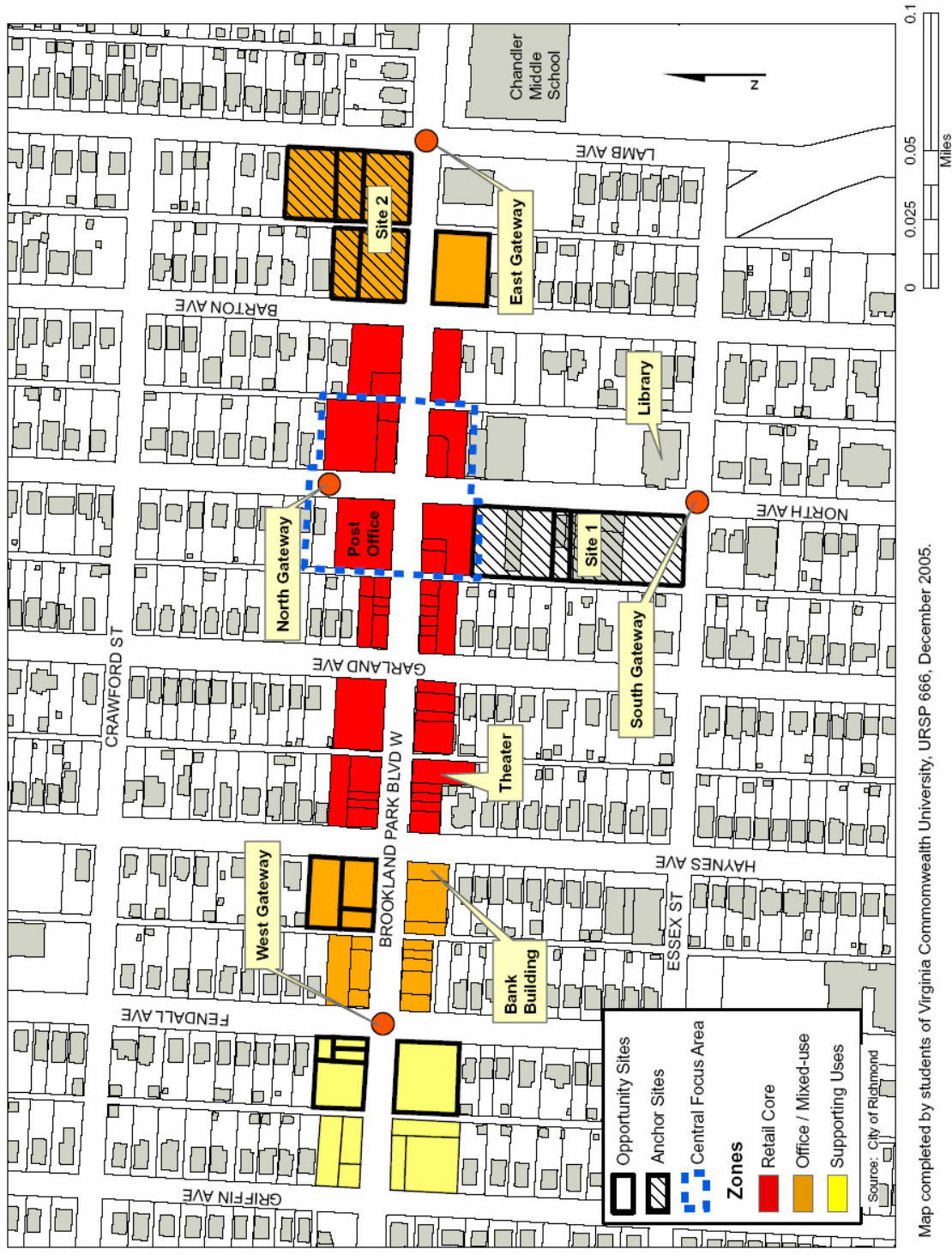
Map 1. The Brookland Park Boulevard Redevelopment Plan