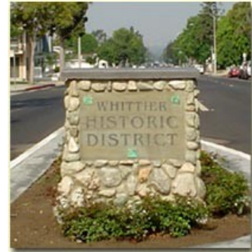
Figure 3. Markers show shoppers that they have come to a unique place

The creation of a logo and slogan for the boulevard can assist with efforts to market the area. The merchants association can use the media for advertising and the promotion of positive news stories about the area. An annual festival and other seasonal events such as holiday lighting can be sponsored by the civic and merchants associations. Art produced by students of Chandler Middle school can be displayed in store windows throughout the year.